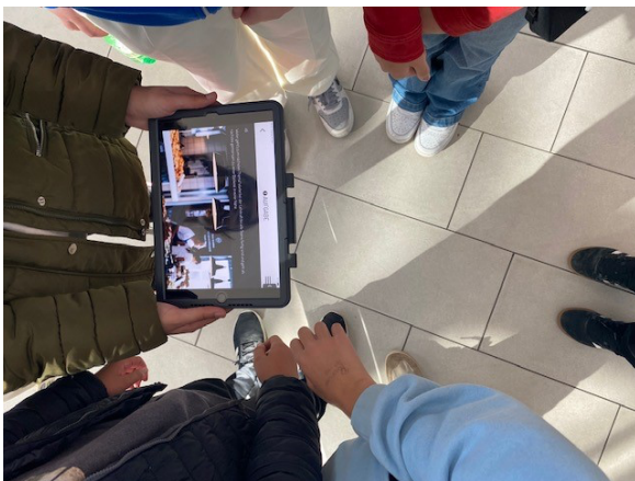
Figure 2: Overview of the City Walk stops